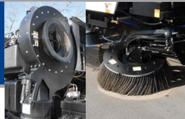
Whisper Wheel™ Fan System